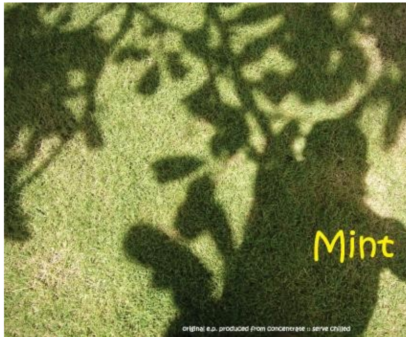
Mint's debut e.p.